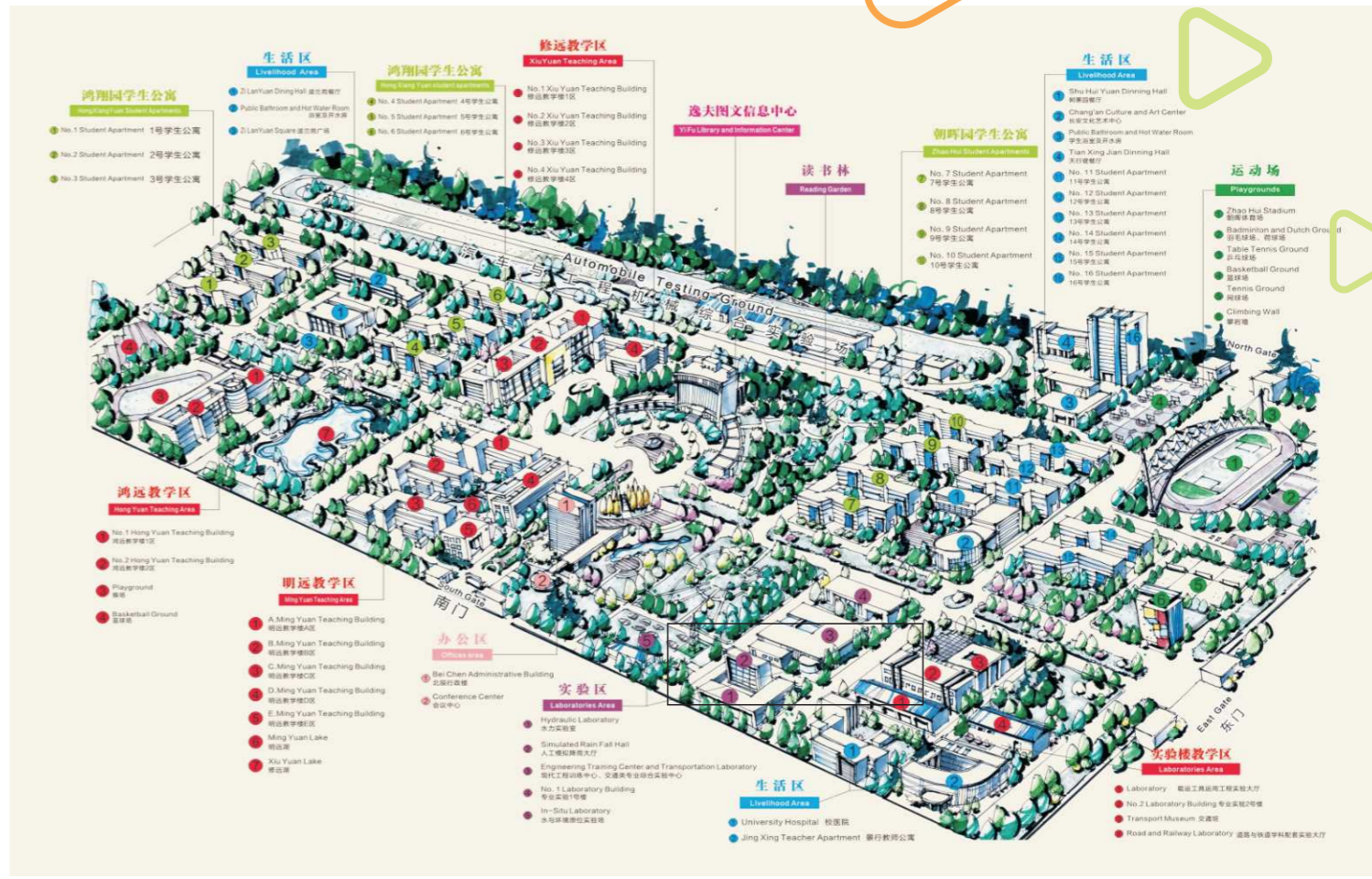
Chang'an University Weishui Campus